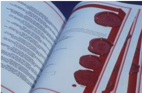
Treaty of Amsterdam signed in Amsterdam on 2 October 1997, and entering into force on 1st May 1999