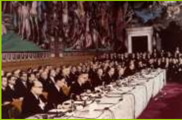
25 March 1957 Treaty of Rome establishing the European Economic Community