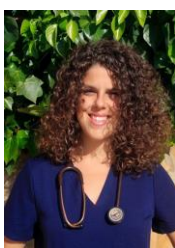
Ambre - Valencia