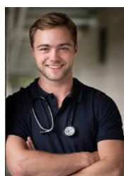
Malte - Utrecht