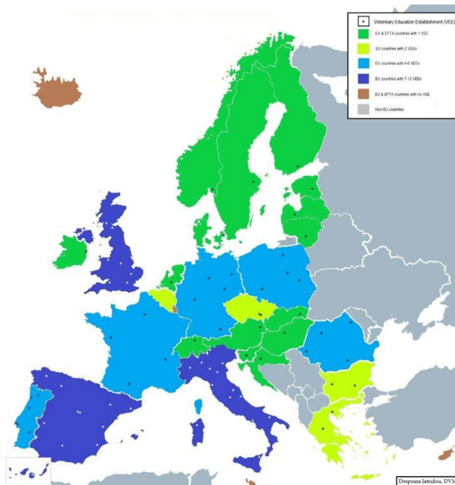
Figure 3 Distribution of veterinary education establishments in the EU and European Free Trade Area.